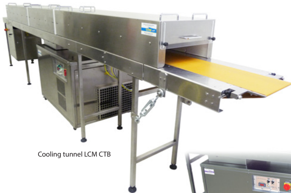
Cooling tunnel LCM CTB

For service-technical reasons, the cooling system with the removable, electronic control can be found in a separate cooling station.